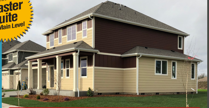
14903 SPARTAN LANE E . SUMNER